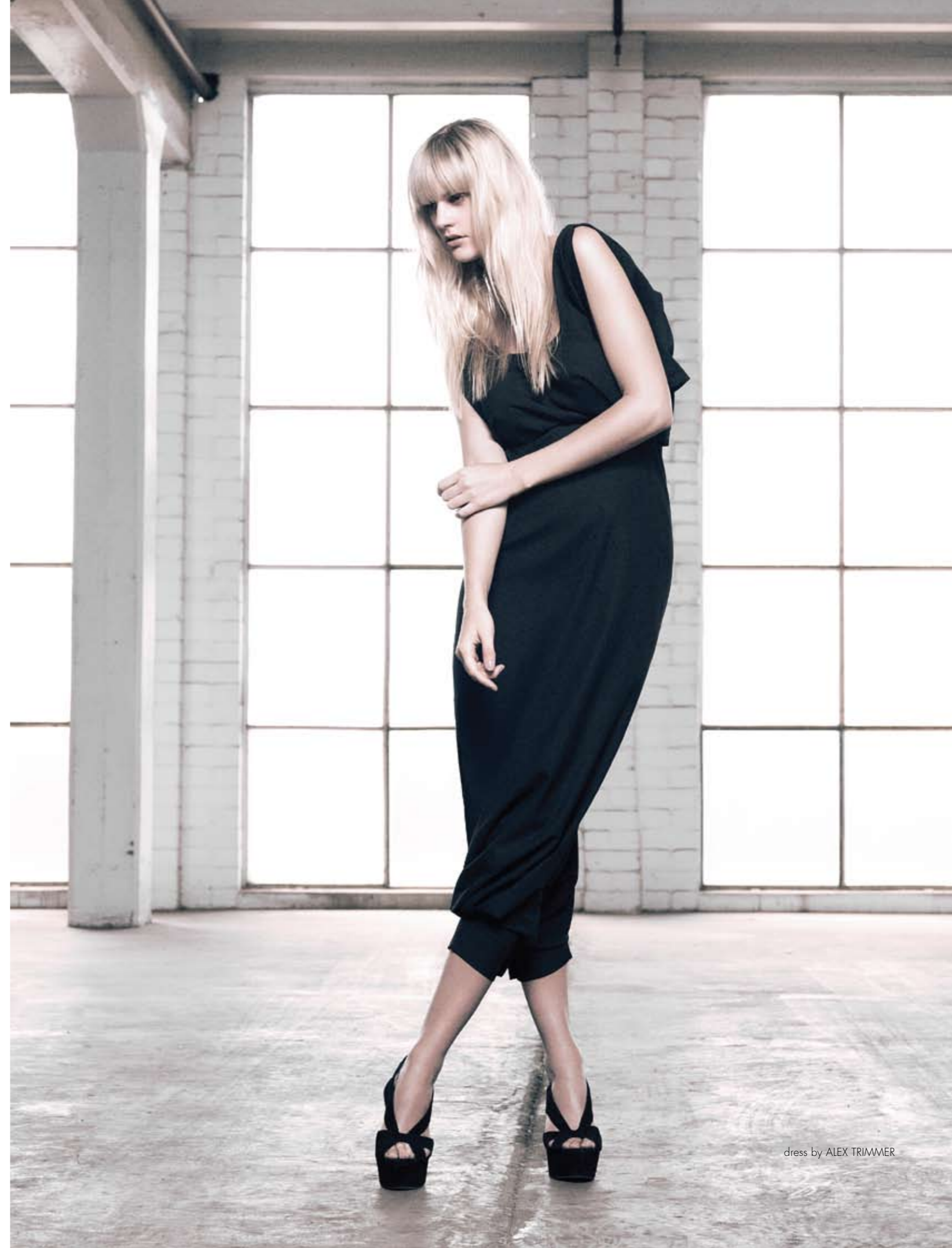
dress by ALEX TRIMMER