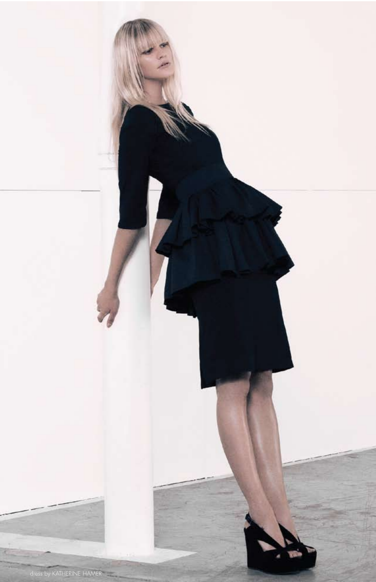
dress by KATHERINE HAMER