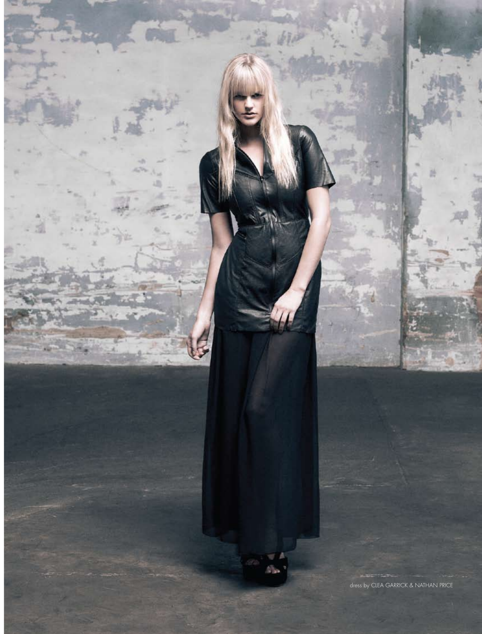
dress by CLEA GARRICK & NATHAN PRICE