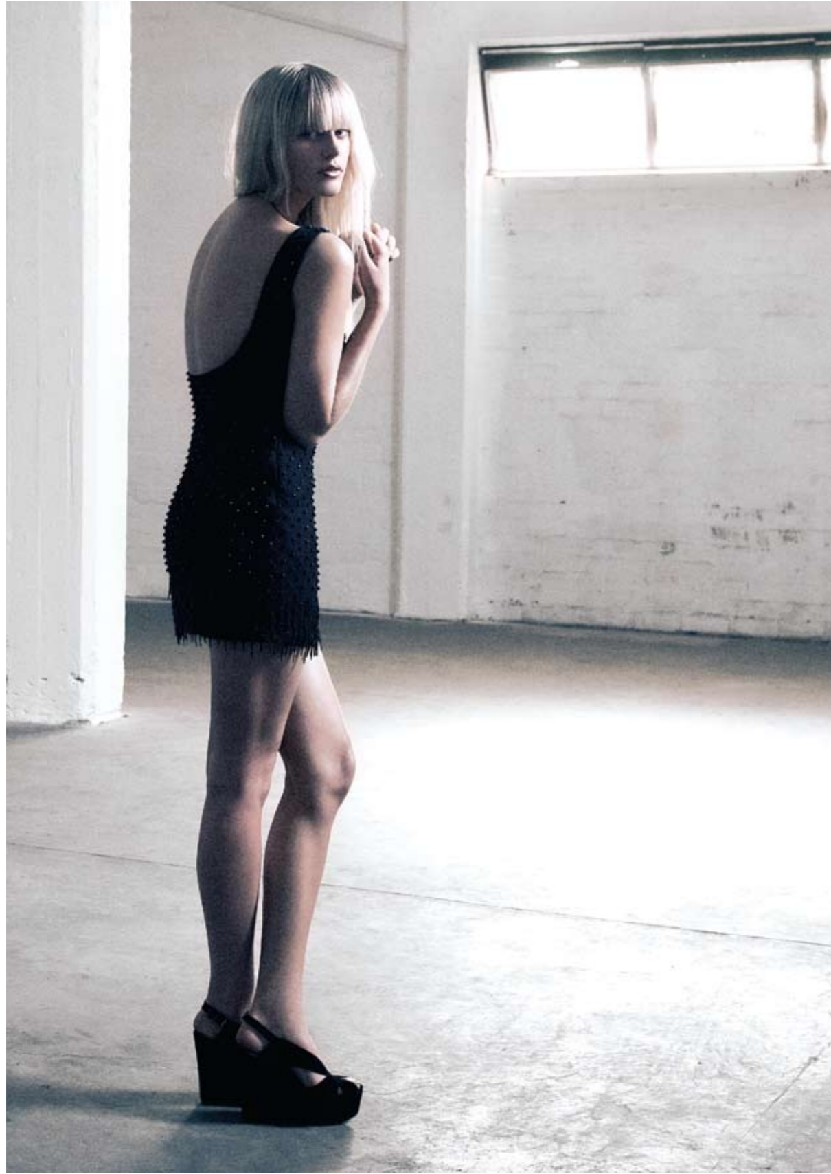
dress by DAN JONES